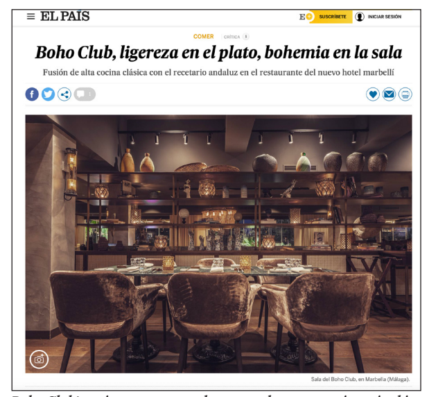
Boho Club's unique concept and renowned restaurant is praised in one of Spain's biggest newspapers, El País.