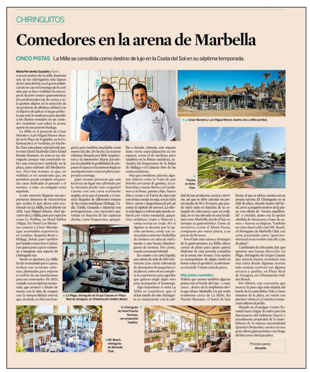
Boho Club and Quartiers Properties are mentioned in the national business magazine Expansión, the Spanish equivalent of Dagens Industri.

zines and the local press in both Spanish and English.